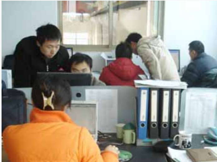
Drawing and Design Training