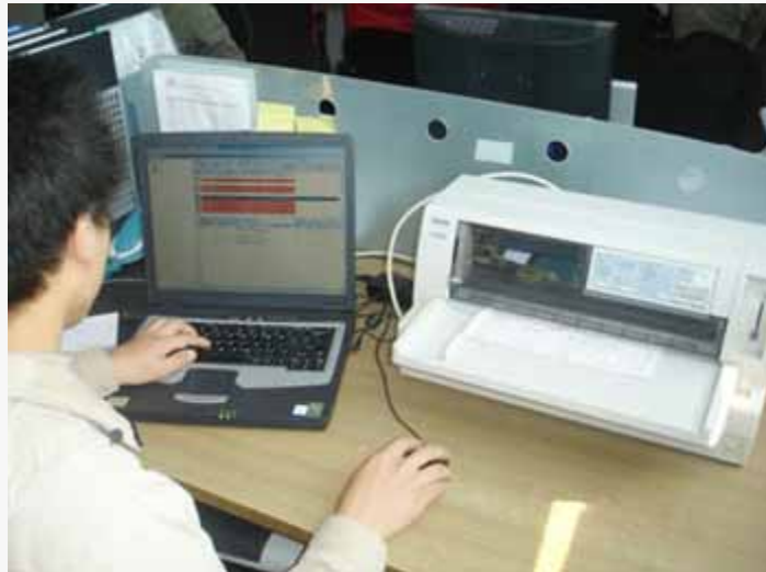
Drawing and Design Training