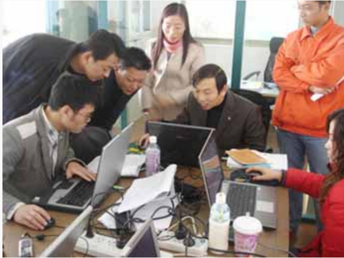
Drawing and Design Training